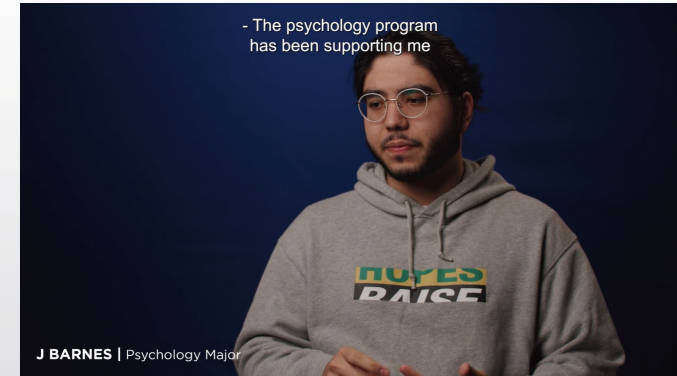
Social media shorts